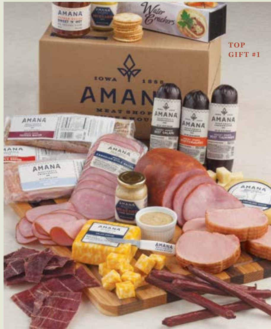
TOP GIFT #1