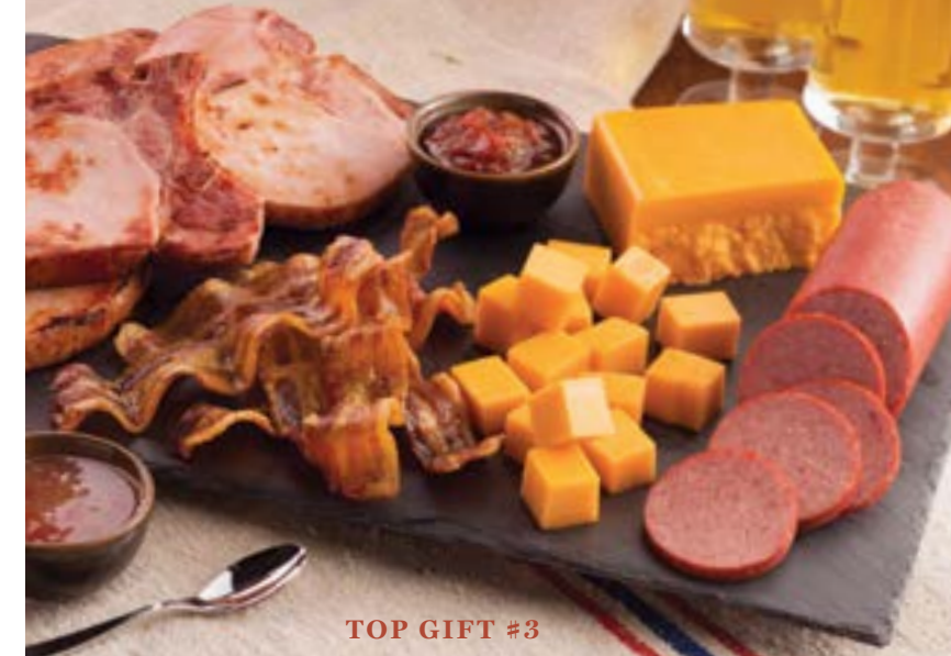
TOP GIFT #3