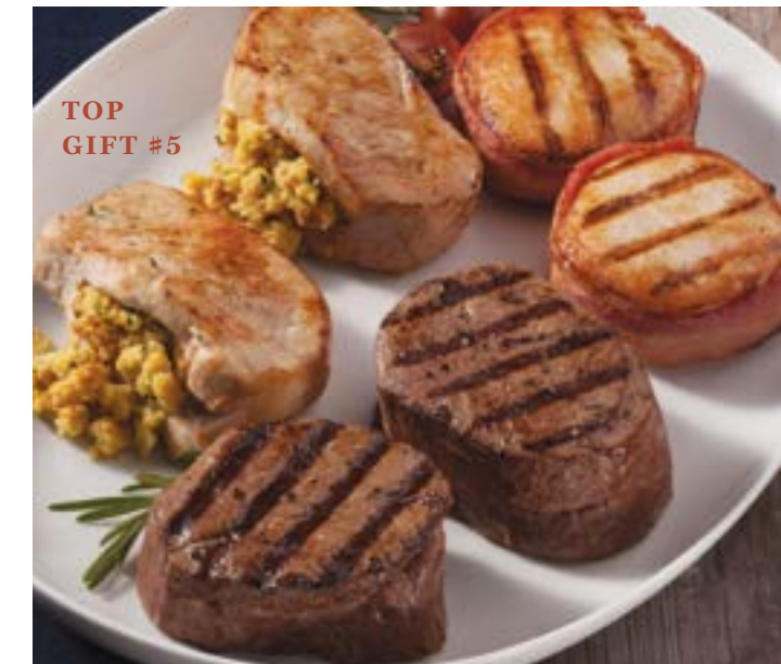
TOP GIFT #5