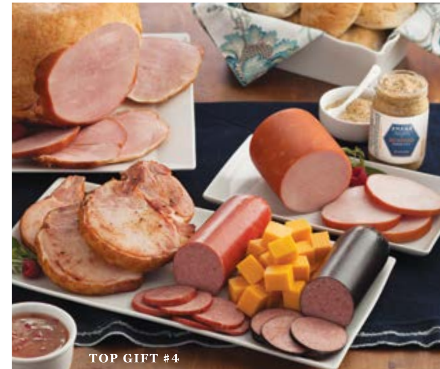
TOP GIFT #4